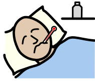
Fig 1: Being Nursed